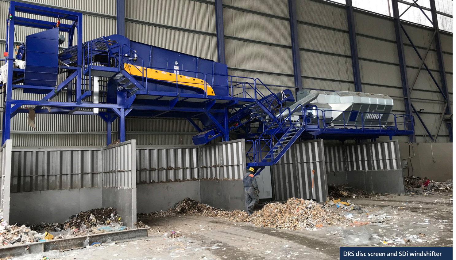
DRS disc screen and SDi windshifter